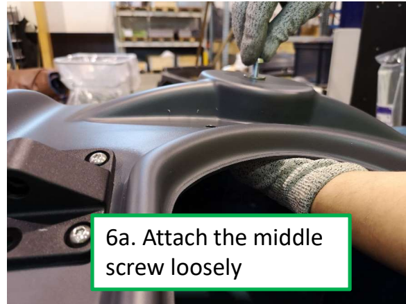
6a. Attach the middle screw loosely

Use M8x25 (Torx-head) bolts and M8 large washer to attach the main lid to the inner hinge.