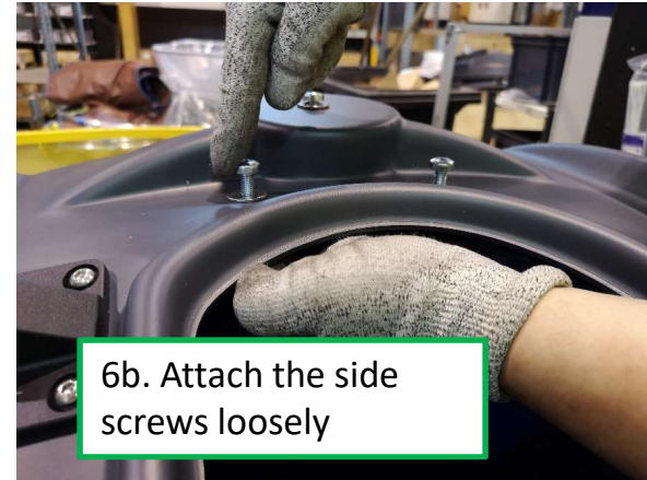
6b. Attach the side screws loosely