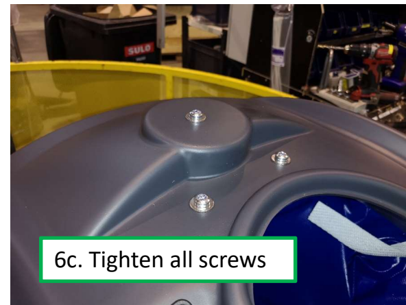
6c. Tighten all screws